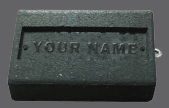
Your Name or Logo Embossed 200 minimum order quantity