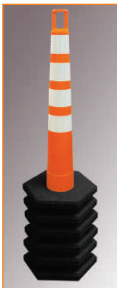
Compact stacking, even with base attached