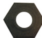
10 lb. or 16 lb. base