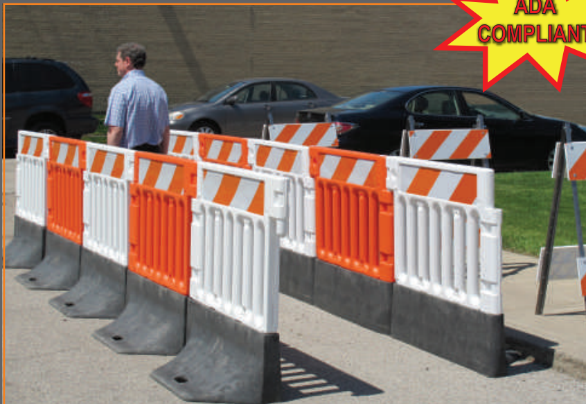
Create a temporary pedestrian walkway