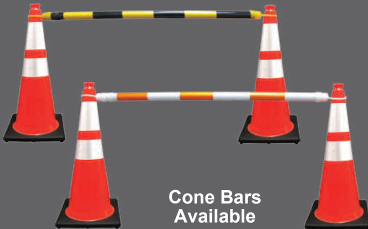
Cone Bars Available