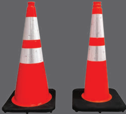
Standard 28" Slimline 28"