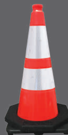
Cone Weights Available, 5 or 7 lbs.