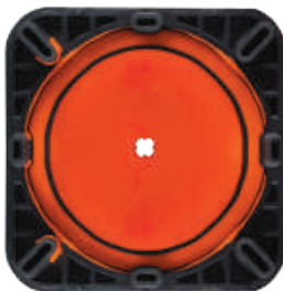
Bottom of Cone