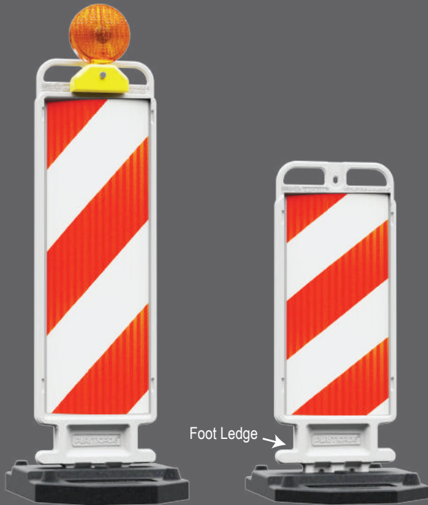
Crosscade™ 36 12" x 36" Panel

Vertical panel with recycled rubber base. Great for crosswalk signage.