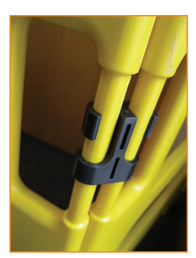
Plastic hinged clips