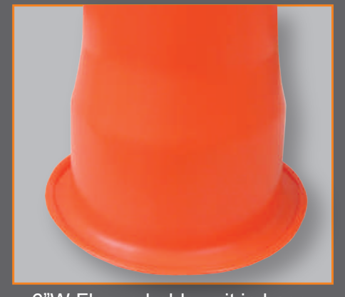
6"W Flange holds unit in base