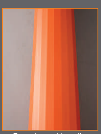
Gemstone sidewall design adds strength & durability