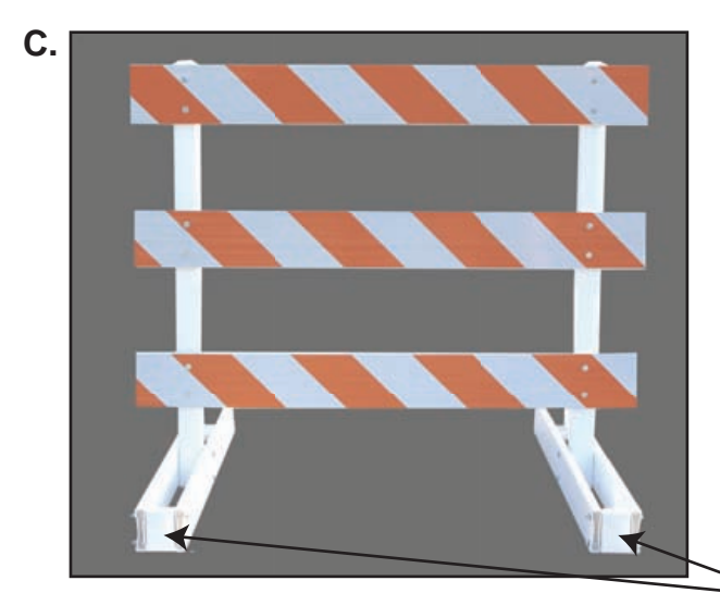
Place boards on front side of uprights. The front side is the side facing the front of the feet