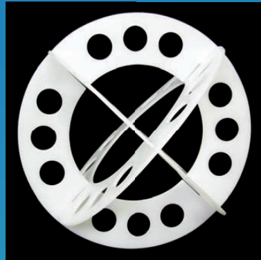
Baffle is made from 3 rings