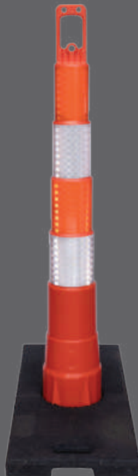
30 lb. Base