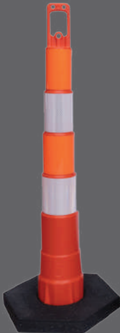
10 & 16 lb. Base