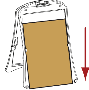
Slide through, pulling sign in front of bottom slot until sign hits the ground