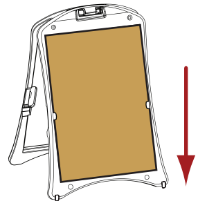
4. Slide sign down into bottom slot