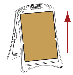
Push sign up into top slot