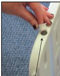
Sand Fill Hole

Each sign frame has two fill holes, one on each half of the frame.