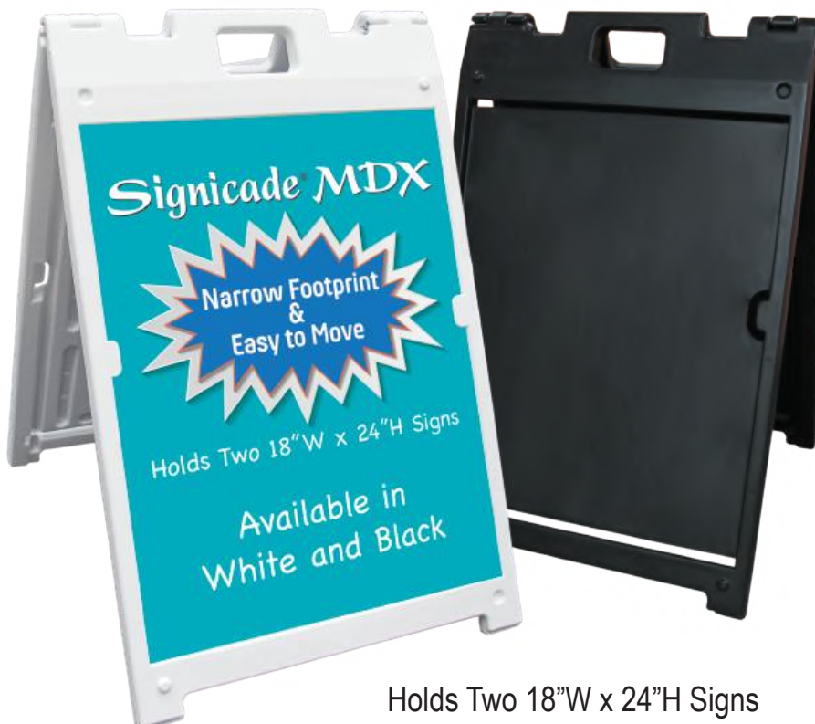
Holds Two 18"W x 24"H Signs

Play sand is suggested for ease of filling.