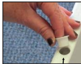
Sand Fill Hole

Each sign frame has two fill holes, one on each half of the frame.