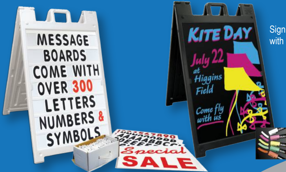
Signicade Deluxe® with Marker Board