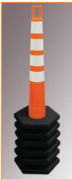
Compact stacking, even with base attached