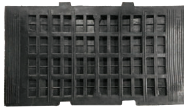
Back View of Premium Speed Hump