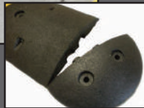
End Caps are optional