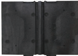
Back View of Standard Speed Hump

Channels for drainage or protect wire, hose, or pipe to 3/4" dia.