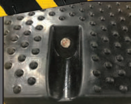
Comes with 8 Cat Eye Reflectors