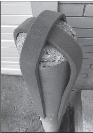
Criss-cross foam strips on top of bollard