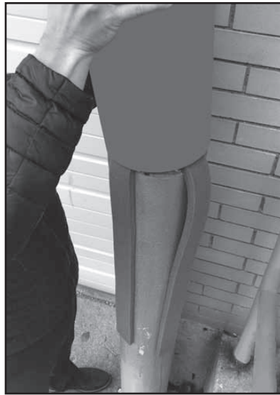
Push cover down over foam strips and bollard